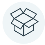
PRINT & PACKAGING