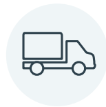
DISTRIBUTION & LOGISTICS