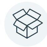
PRINT & PACKAGING